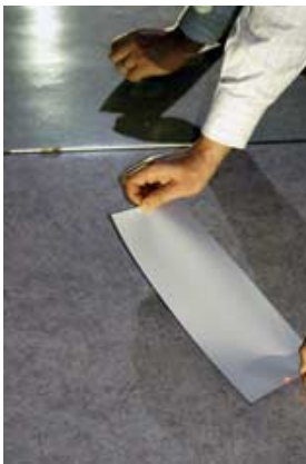
Image 2: Apply the Gellifter so that the center-point of each end covers one of the laser dots.