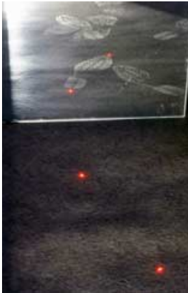
Image 1: Use two laser pointers to indicate the shoeprint on the floor.

The shoeprint is now lifted and can be taken to the lab for photography and further examination. Image 3 shows the actual color of the floor from which the sample print was lifted.