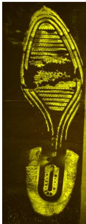
Image 3: Fluorescence of a lifted shoeprint in blood stained with Acid Yellow 7, 2nd lift.