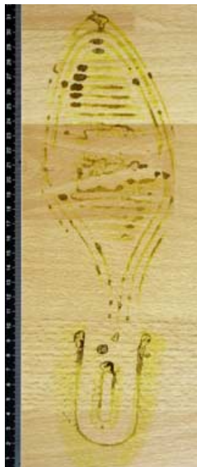
Image 1: Shoeprint in blood on a hardwood floor, treated with Acid Yellow 7.

To obtain the best result, eliminating backgrounds and/or background fluorescence, stained prints can be lifted with a white BVDA Gellifter.